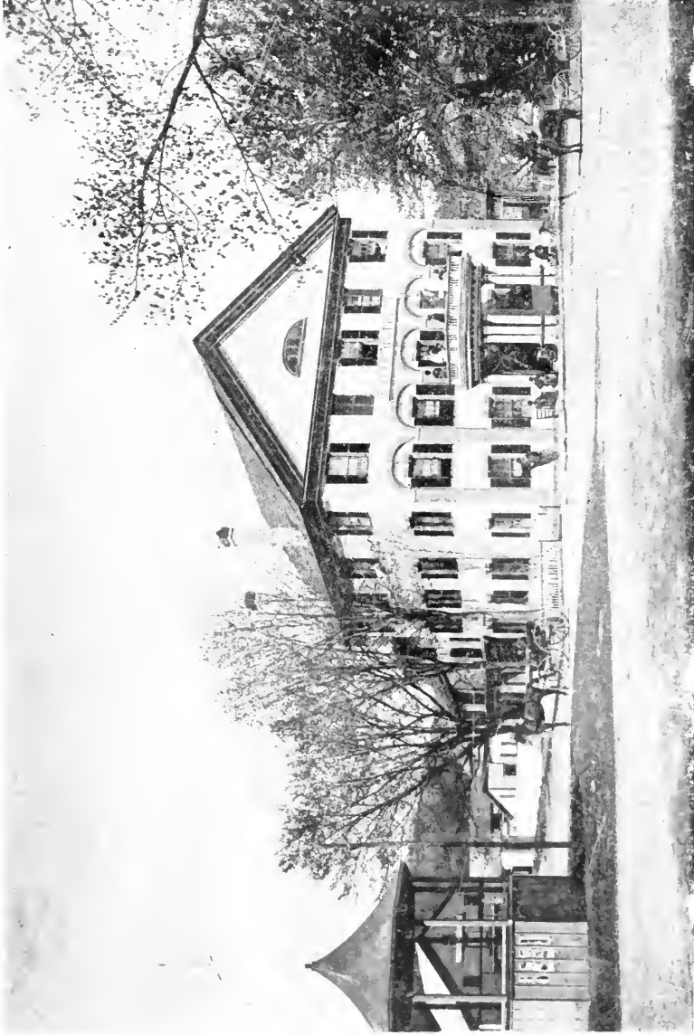
A FAMOUS OLD-TIME LANDMARK OF CHARLESTOWN . . . . The Eagle Hotel